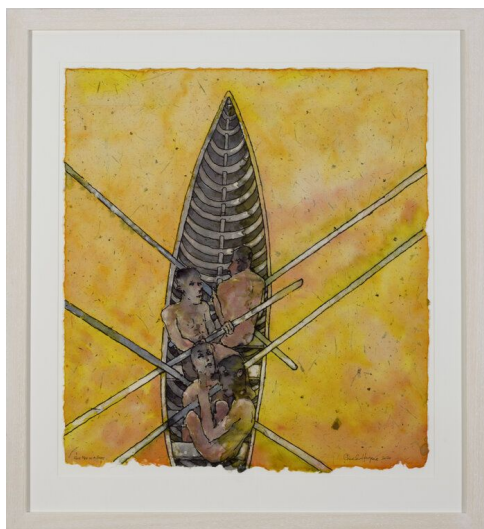
Four Men in a Boat, Watercolour on Japanese Paper, 55 x 50cm, €5,000.