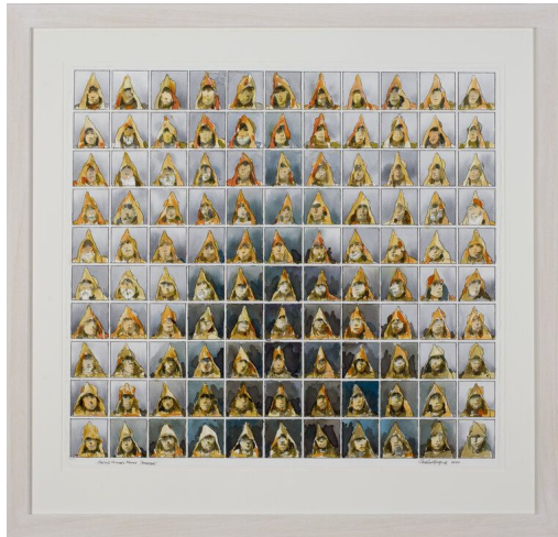
Skellig Michael Monks Nov '20, Watercolour on Saunders, 50 x 55cm, €5,000.