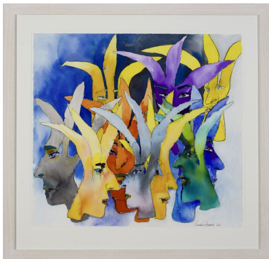
Social Interaction A, Watercolour on Saunders, 50 x 55cm, €5,000.