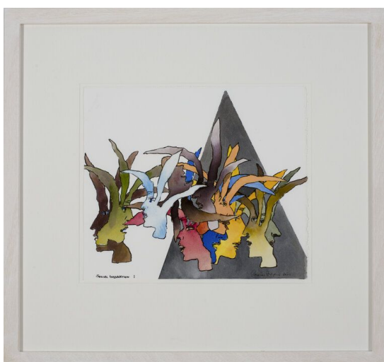
Social Interaction 1, Watercolour on Saunders, 25 x 28cm, €3,500.