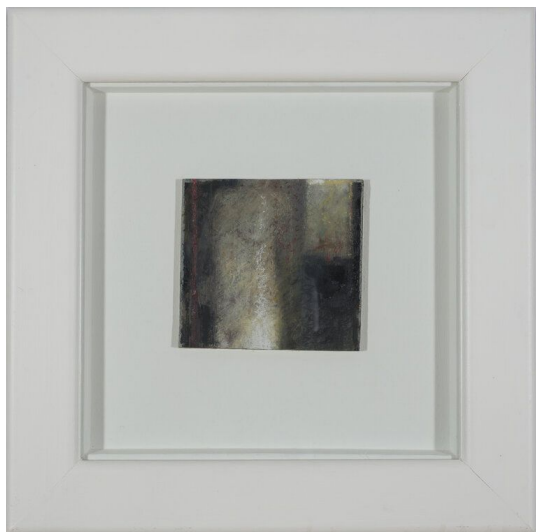
Edith Leaving Sodom 1, Oil pastel, oil on panel, 15 x 15cm, €4,500.