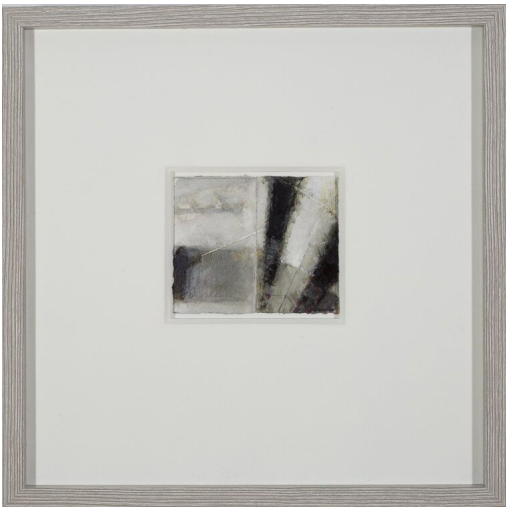
Child Kite, Loop Head, Watercolour, 14 x 12cm, €2,500.