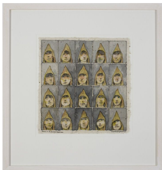
Monks of St. Fionan's Monastery, Watercolour on Handmade Paper, 28 x 26cm, €3,500.