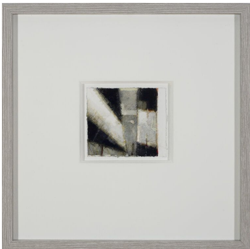
Kite And Lighthouse, Watercolour, 14 x 12cm, €2,500.