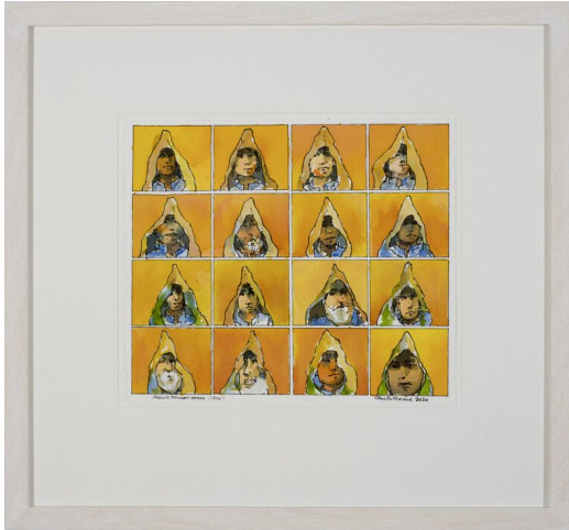
Skellig Monks July, Watercolour on Handmade Paper, 25 x 28cm, €3,500.