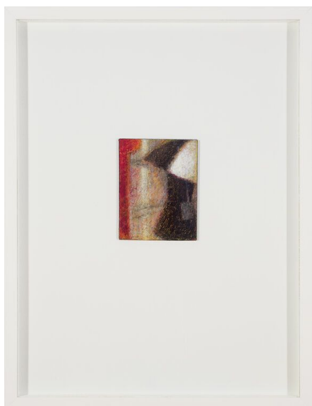
Wet Day, Roxboro Rd. Bus Stop, Oil pastel, oil on panel, 21 x 16cm, €6,500.