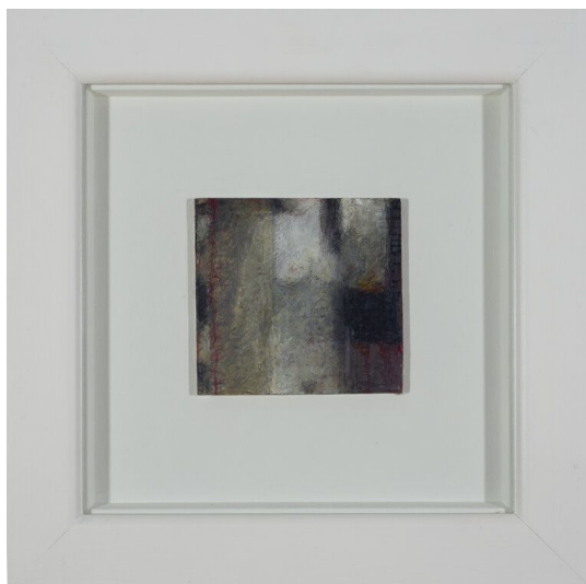
Edith Leaving Sodom 3, Oil pastel, oil on panel, 15 x 15cm, €4,500.