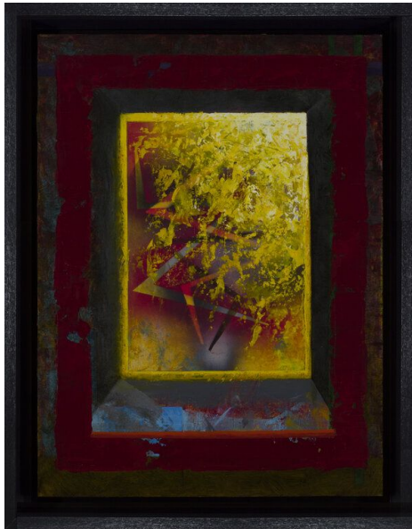
Cascade of light (2019)