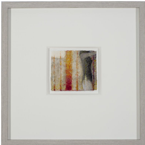
Circus Day, Trapeze 1, Watercolour, 14 x 12cm, €2,500.