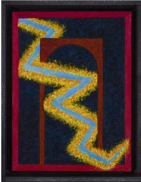
The Lightning Conductor's Tower (2019)