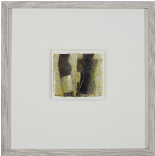
Boutique Window 2, Watercolour, 14 x 12cm, €2,500.