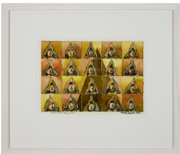
Skellig Monks August, Watercolour on Handmade Paper, 21 x 28cm, €3,500.