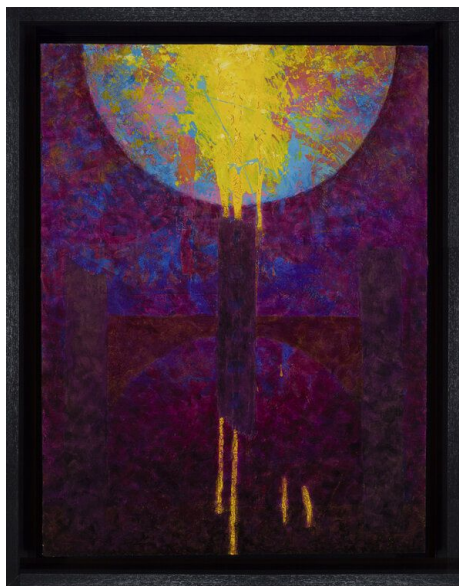
Paintworks Display (2019) Mixed media on MDF 60 x 45cm €5,900