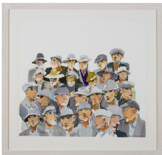
Men in Hats, Watercolour on Saunders, 50 x 55cm €5,000.