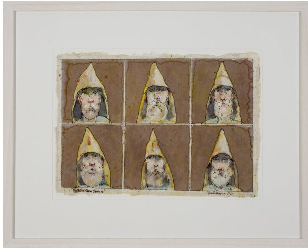
Monks of Great Skellig, Watercolour on Japanese Paper, 27 x 39cm, €4,000