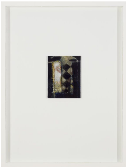
Joker Scarecrow, Oil pastel, oil on panel, 21 x 16cm, €6,500.