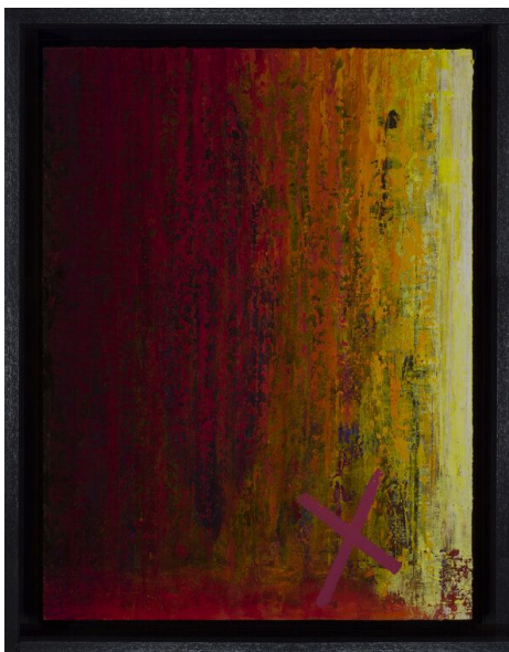
Gustave's Grotto (2019)