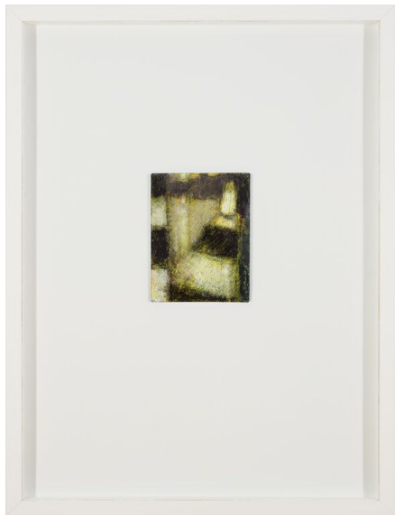
Child Crossing Cathedral Place, Oil pastel, oil on panel, 21 x 16cm, €6,500.