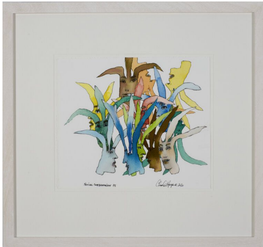
Social Interaction 3, Watercolour on Saunders, 25 x 28cm, €3,500.