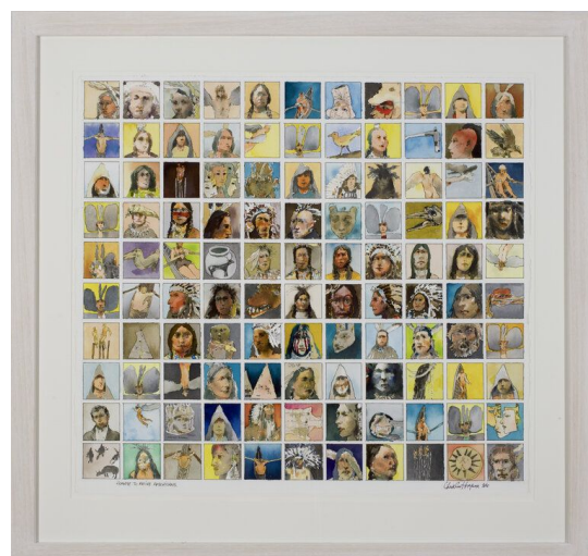
Homage to Native Americans 2, Watercolour on Saunders, 50 x 55cm €5,000.