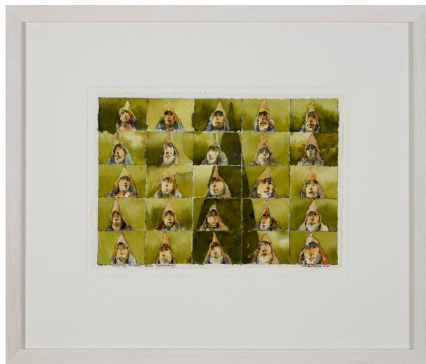
Skellig Michael Monks September, Watercolour on Handmade Paper, 28 x 28cm, €3,500.