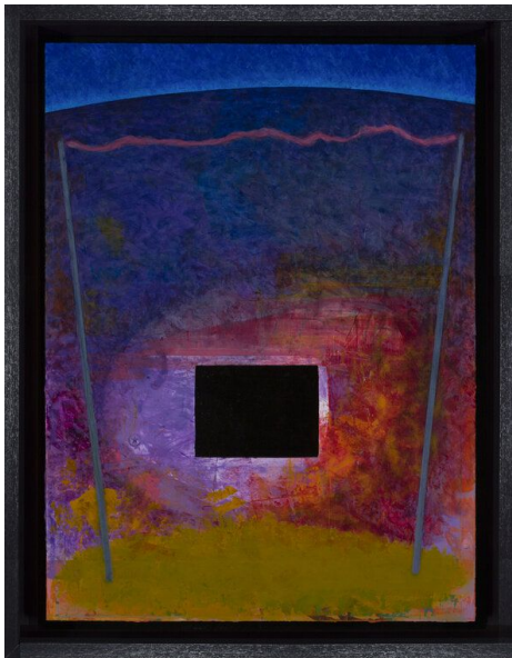
High Wire Act (2019)