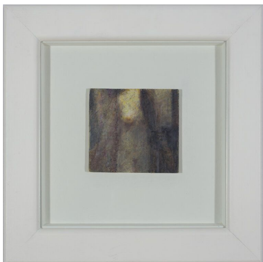
Edith Leaving Sodom 2, Oil pastel, oil on panel, 15 x 15cm, €4,500.