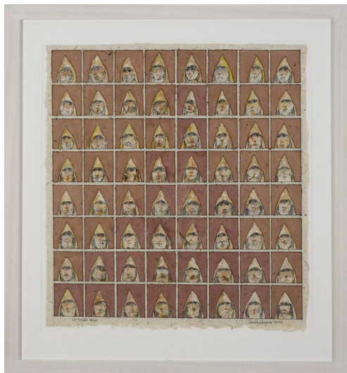
St. Fionan's Monks, Watercolour on Japanese Paper, 55 x 50cm, €5,000.