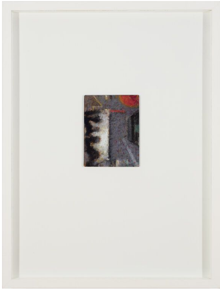
Scarecrow and Mars, Oil pastel, oil on panel, 21 x 16cm, €6,500.