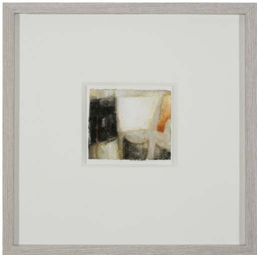
Lighthouse Woman's Cats and Washing, Watercolour, 14 x 12cm, €2,500.