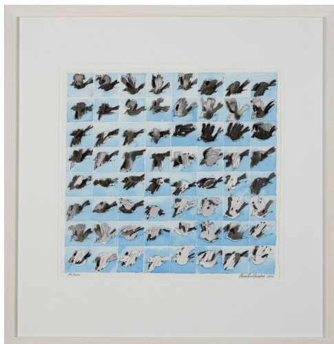
Flight, Watercolour on Handmade Paper, 34 x 35cm, €4,000.