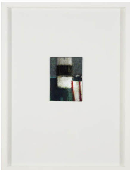
St. John's Point Lighthouse, Oil pastel, oil on panel, 21 x 16cm, €6,500.