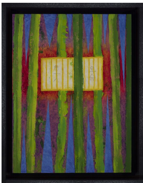
Wild Things (2019)