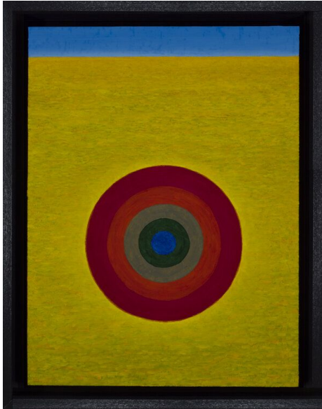
Target Field (2019) Mixed media on MDF 60 x 45cm €5,900