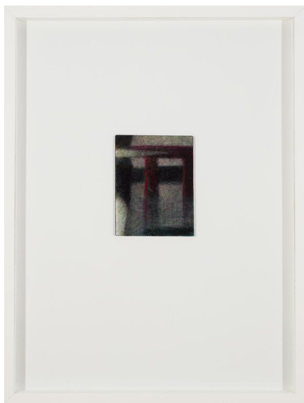
Late Swim, Oil pastel, oil on panel, 21 x 16cm, €6,500.