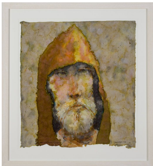
Abbot of St Fionan's Monastery, Watercolour on Japanese Paper, 55 x 50cm, €5,000.