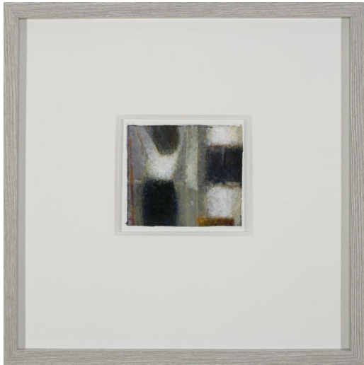
Lighthouse Woman's Washday, Watercolour, 14 x 12cm, €2,500.