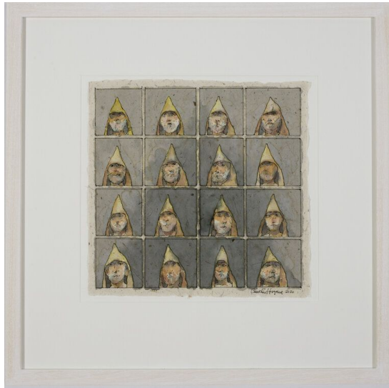
Monks of Skellig Michael, Watercolour on Japanese Paper, 28 x 28cm, €3,500.