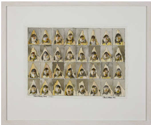
Skellig Michael Monks October, Watercolour on Handmade Paper, 30 x 40cm, €4,000.