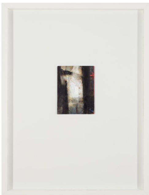
Self Portrait Scarecrow, China Wall, Oil pastel, oil on panel, 21 x 16cm, €6,500.