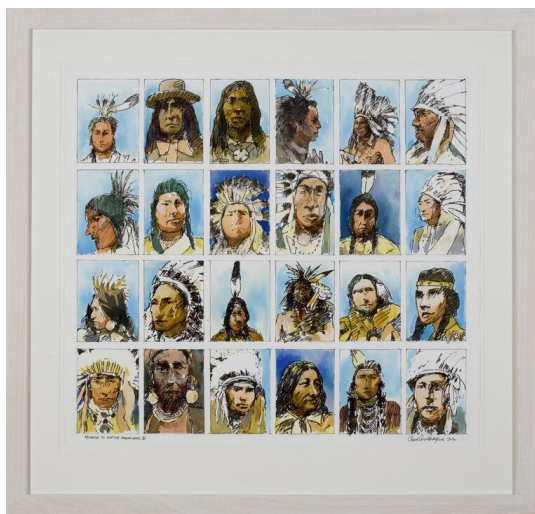
Homage to Native Americans 1, Watercolour on Saunders, 50 x 55cm €5,000.