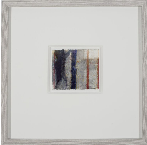
Circus Day, Trapeze 2, Watercolour, 14 x 12cm, €2,500.