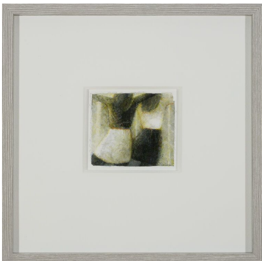
Boutique Window 1, Watercolour, 14 x 12cm, €2,500.